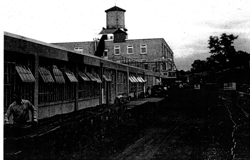
Boxes of grapes are delivered to the Welch’s Grape Juice plant in Youngstown, New York in 1935.

Charles Welch understood the power of advertising. Welch’s was the only non-alcoholic fruit juice on the market—but in order to make unfermented wine a viable product, he knew he must create a demand for it, educate the public about its qualities, and overcome prejudice against it. In 1893, samples of the juice were distributed at the World’s Columbian Exposition in Chicago, and by 1896 the